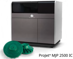
Projet® MJP 2500 IC

Building productivity and new manufacturing efficiencies with tool-less 3D printed casting pattern production from 3D Systems